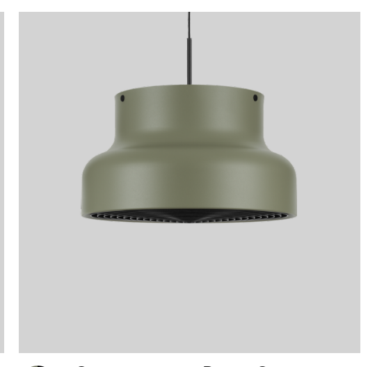
Contemporary Dusty Green NCS S 6010-G70Y Fine texture